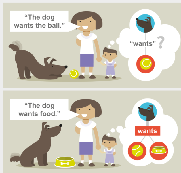
Illustration by Lucy Reading-Ikkanda

New approaches to linguistics and psychology suggest that children's natural ability to intuit what others think, combined with powerful learning mechanisms in the developing brain, diminishes the need for a universal grammar. Through listening, the child learns patterns of usage that can be applied to different sentences. The word “food” might replace the word “ball” after the phrase “The dog wants.” Studies show that this theory of building up knowledge of word meaning and grammar approximates the way that two- and three-year-olds actually learn language.