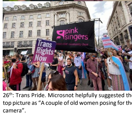
26 th : Trans Pride. Microsnot helpfully suggested the top picture as “A couple of old women posing for the camera”.