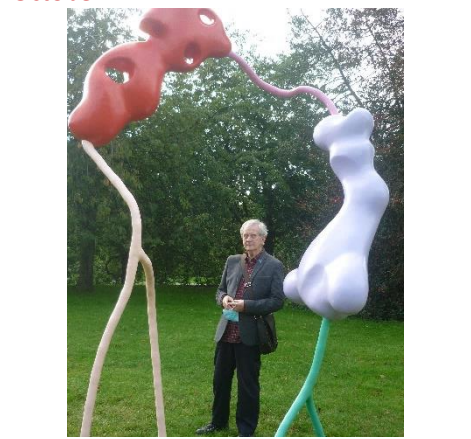
9 th : Regents Park Frieze Sculpture exhibition – Art in the Park. A rather uninspired collection.