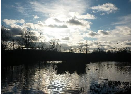
2 nd : Olympic Park – our haven through lockdowns.