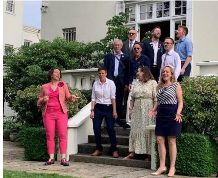
16 th : Pinkies sing at the US Embassy.