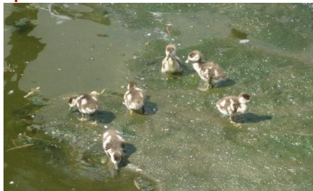
27 th : Egyptian goslings; the first time they have nested successfully in the Olympic Park.