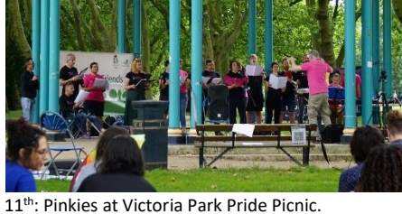
11 th : Pinkies at Victoria Park Pride Picnic.