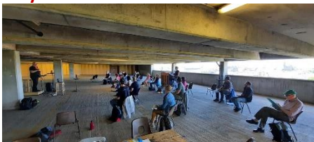
30 th : First Pinkies post-lockdown live rehearsal; the rest of the choir is on Zoom.