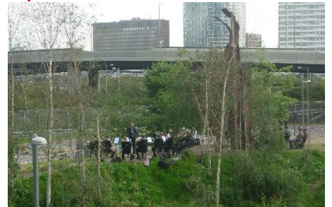
11 th : 20 Anniversary of 9/11 at the Memorial in the Olympic Park. The memorial is constructed of twisted metalwork from the Twin Towers.