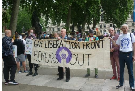
24 th : Reclaim Pride London March.