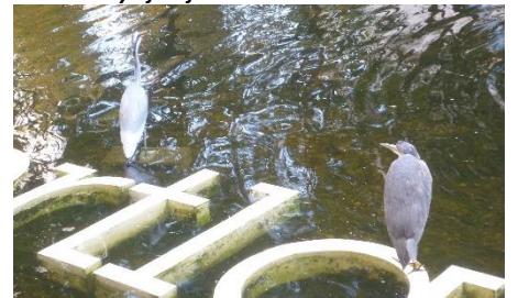
16 th : 2021 in a nutshell – a disconsolate male heron courts a plastic facsimile at Portland Ponds.

4 th : Last day of self-isolation. That’s all there is.