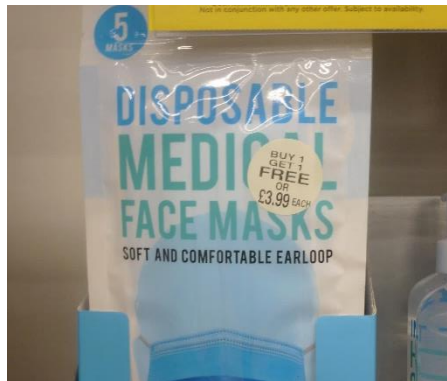
22 nd : Lockdown is getting to some shop staff.