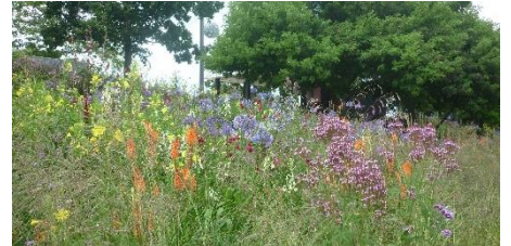
3 rd : Blooms in the Olympic Park.